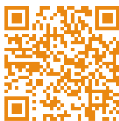
Fall Term 2020/21